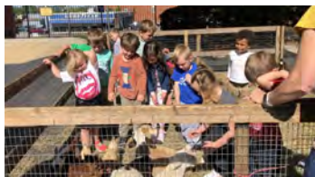
THE PETTING ZOO CAME FOR A VISIT!