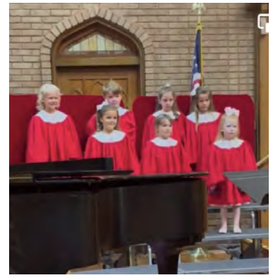
The Cherub Choir Ages 4 & 5

What a fun and talented group of singers! They meet on Tuesday mornings at 9:30am to rehearse! They are always looking for new members to join!