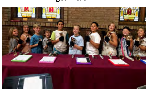
Bellissimo Handbell Choir