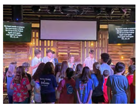
BOUND | Our Youth Led Praise Band

UTH Bible & Biscuits is still going strong on Wednesday mornings at Truett's Chick-fil-A. We meet at 7:00am before school to discuss the Book of Romans. All are welcome to join in the good food and great discussion!