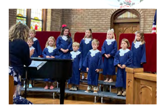
The Wesley Choir Grades 1 & 2