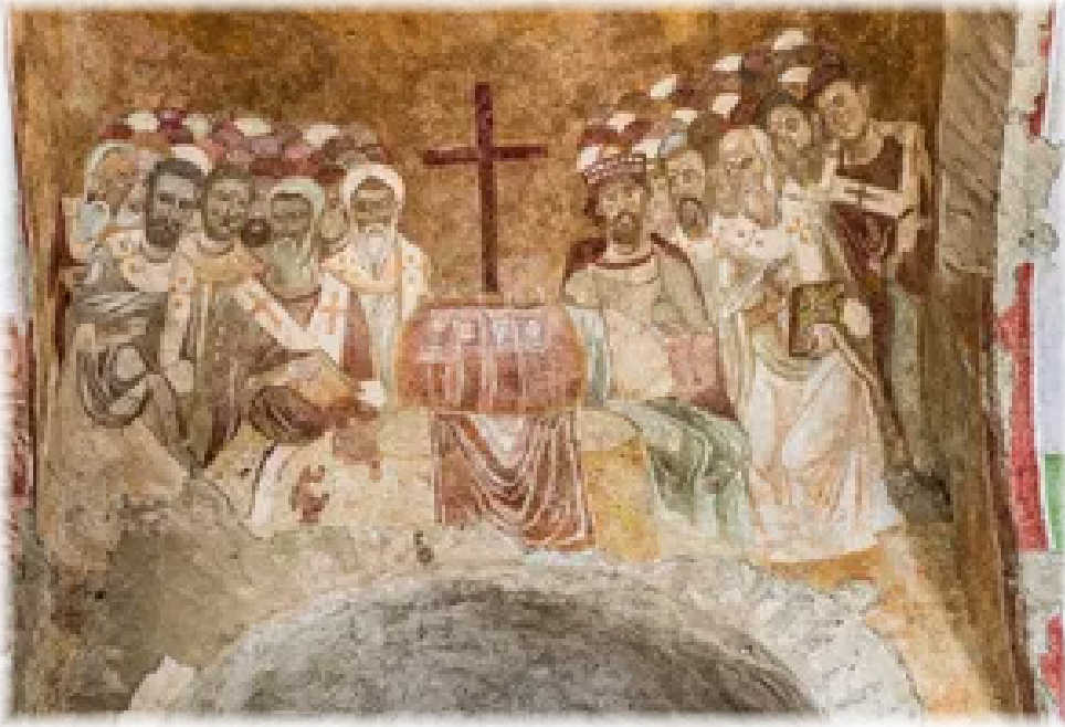
First Council of Nicaea Council of Nicaea in 325, depicted in a Byzantine fresco in the basilica of St. Nicholas in Demre, Turkey.

www.newnanfumc.org/give Text "NFUMC" to 73256